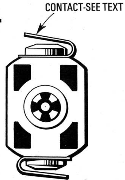
Brush Contact Arrangement